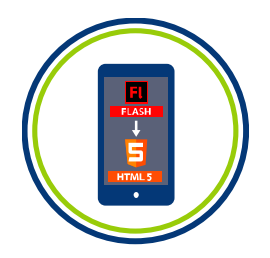
Legacy eLearning Course Conversion